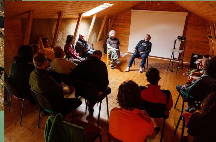
Training room in Ecocenter