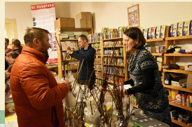
Bio-trade „Malý princ“