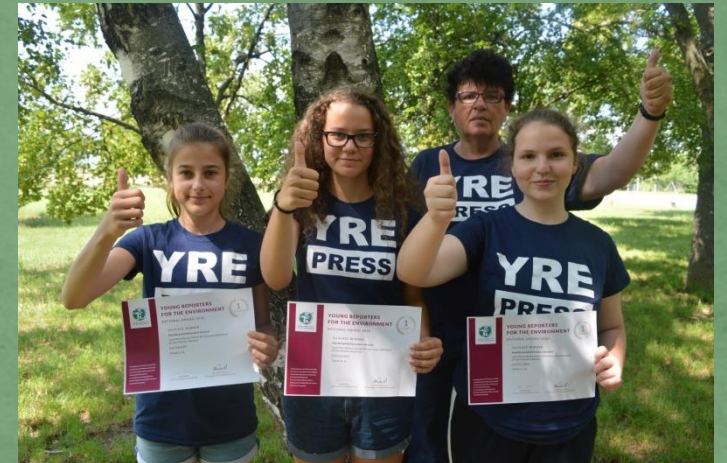
Authors of the winning article about the water pollution (category: 11-14)