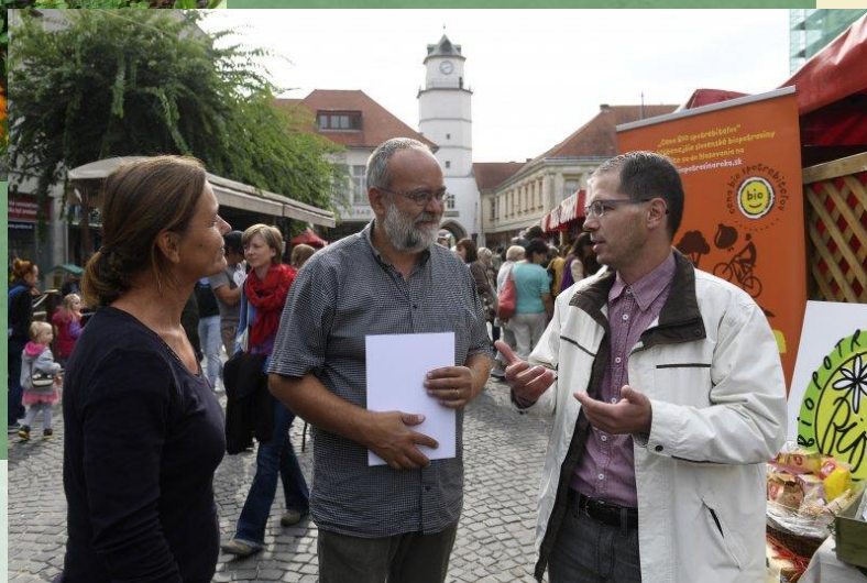
Discussion about the Slovak BIO