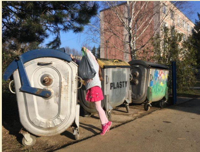
Winning photo: On Tiptoes (category: 11-14)