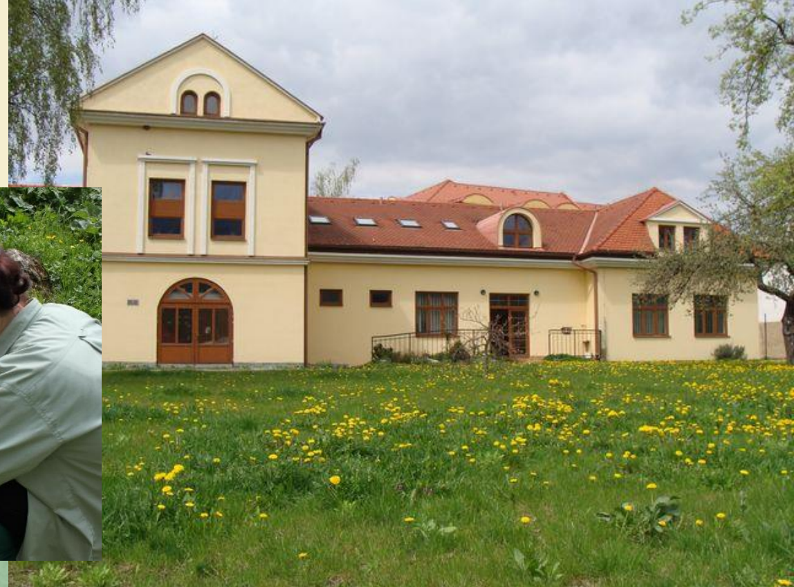
Garden at Nature Conservation School